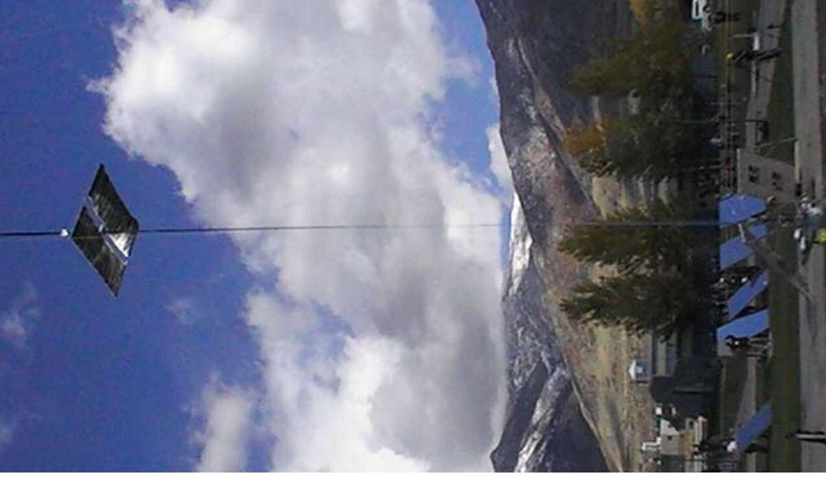
Solar energy climber at NASA beam power challenge Salt Lake City